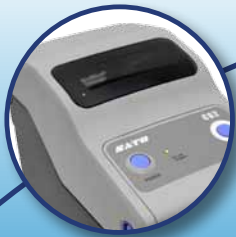
Anti-Microbial Casing (CG2 only)