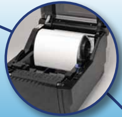
Drop - Load - Go Media Bin